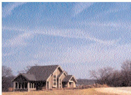
111 W. Glen Hollow Road

Happy Spring! Go out and plant some flowers. ❁