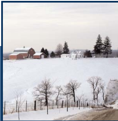
Gratton Farm, Mount Hope Road

One kind word can warm three winter months.